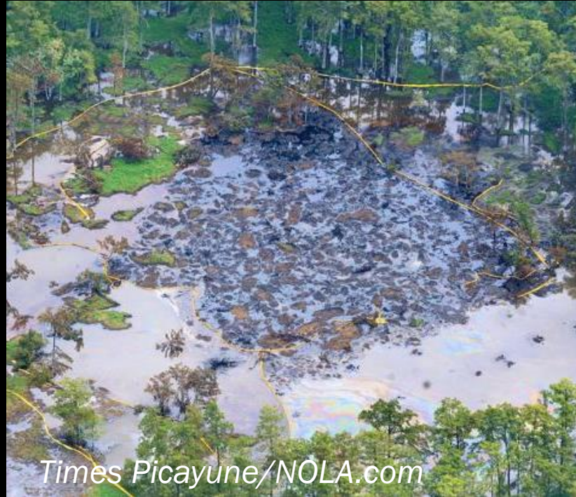
Bayou Corne sinkhole disaster