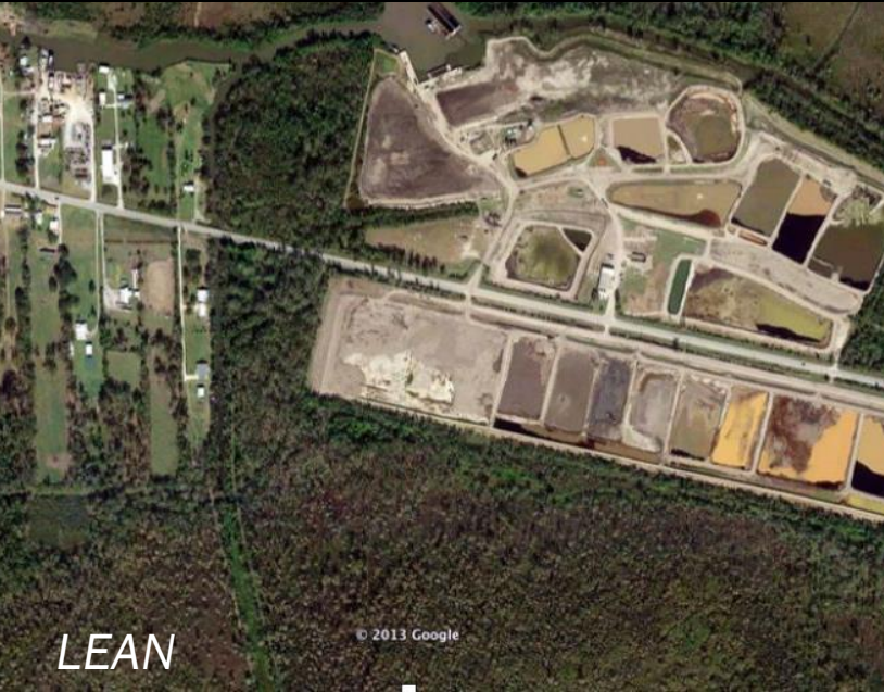
Harmful oil field waste next to Grand Bois