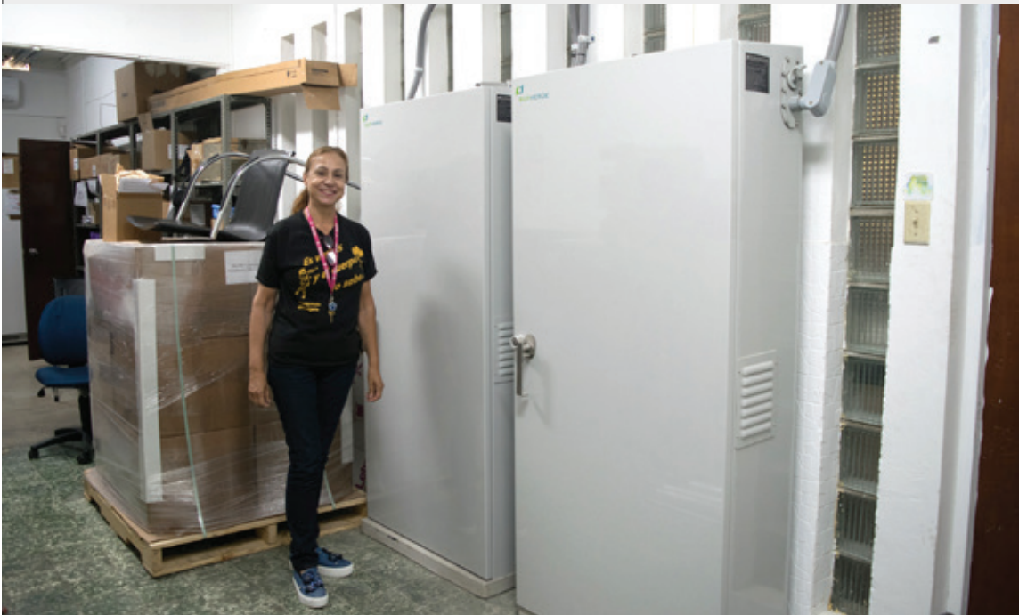
View of the 20-kW Sunverge battery storage system at the Clinica Profamilia in San Juan, Puerto Rico. This community medical clinic was the recipient of technical and financial support from CEG's Technical Assistance Fund, enabling the installation of a resilient solar+storage system.

To learn more about the TAF, or to apply, visit www.cleanenergygroup.org/ceg-projects/resilient-power-project/technical-assistance-fund .