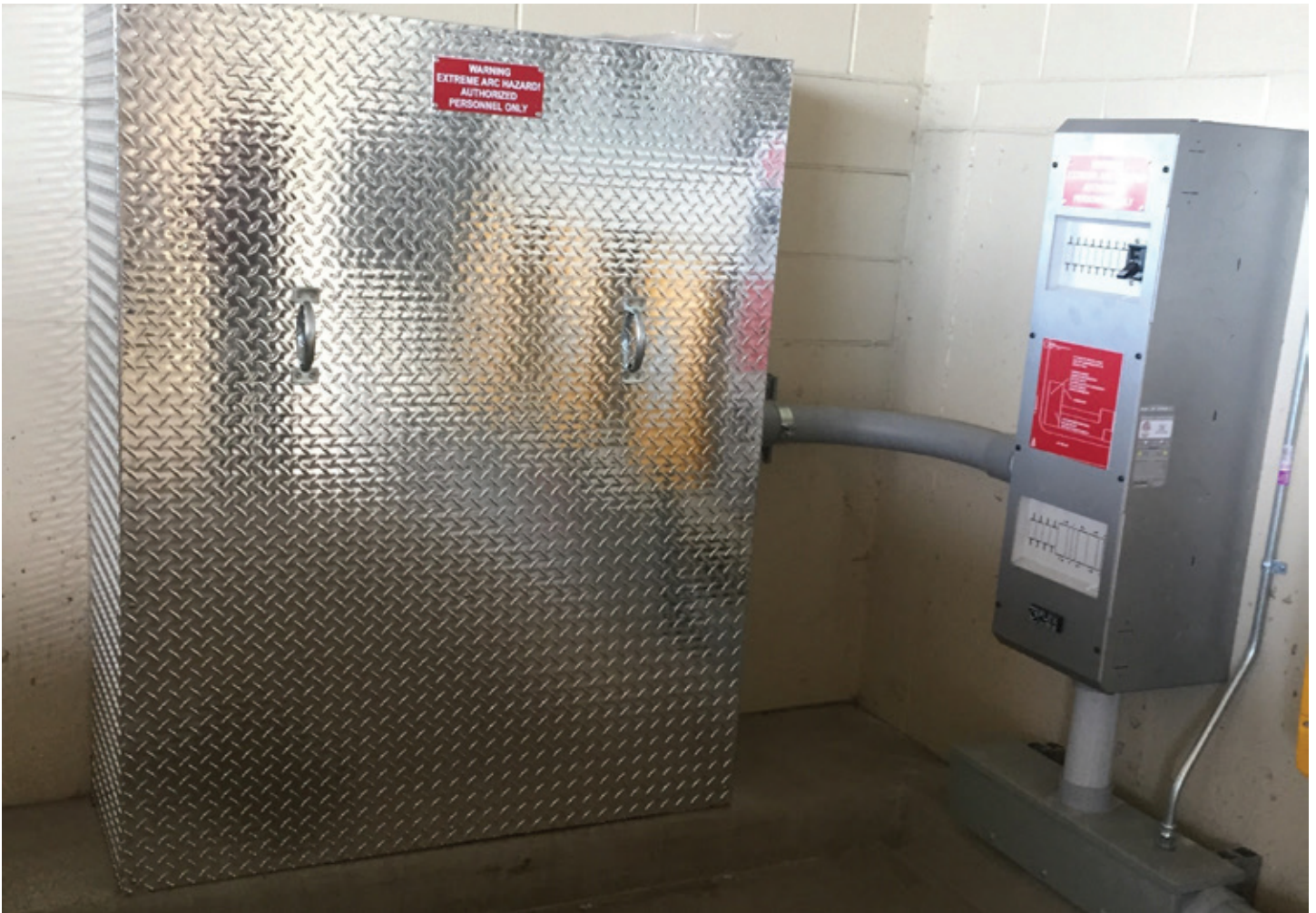
Solar+storage system at Boulder Housing Partners (BHP) headquarters in Boulder, CO. The resilient solar+storage system is paired with a backup generator.