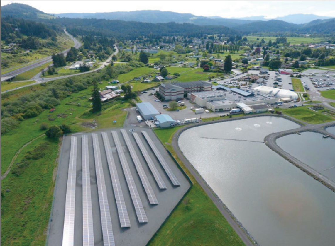
Blue Lake Rancheria Tribe Microgrid Project in Humboldt Bay, CA

During a 2019 Public Safety Power Shutoff (PSPS) in California, the Blue Lake Rancheria Microgrid (BLR) provided critical services through the outage. 47 Owned by Blue Lake Rancheria, a federally recognized Native American tribe in northwestern California, the microgrid serves tribal government offices, EV charging, a hotel and casino. During the outage, the hotel hosted eight community-members with medical needs reliant on electricity. The Humboldt County Department of Health and Human Services credited Rancheria with “saving their lives, due to their critical needs for power.”