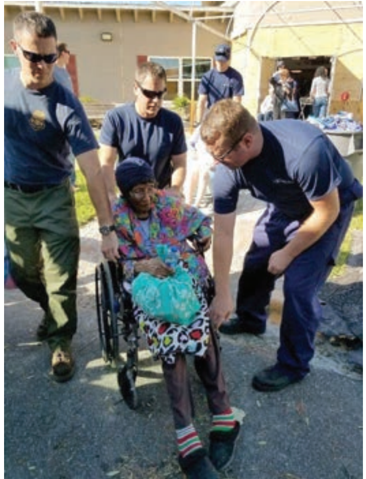
Coast Guard shallow-water response team personnel assist 142 residents at Panama City Health and Rehabilitation Center in Panama City, Florida, Oct. 11, 2018, following Hurricane Michael. The Center needed food, water, and portable oxygen for their patients.

In the event of a heatwave, oftentimes emergency preparedness alerts will encourage people to stay cool by staying indoors. In low-income communities and communities of color, the multi-level housing infrastructure can actually make for even more dangerous heat-related conditions because the temperature inside the building increases with each additional apartment floor, and air conditioning can be limited (if available at all). Apartments are the least likely of all housing types to have air conditioning. Only 80 percent of 1-to-5-unit buildings and 85 percent of over-5-unit buildings use air conditioning. Comparatively, 90 percent of single-family households have air conditioning; although, renters of single-family homes are less likely to have air conditioning. 29