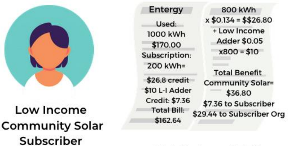
Image 4. Proposed Bill Consolidation, low generation relative to usage +free subscription