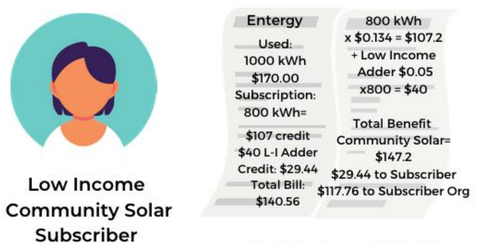
Image 3. Proposed Bill Consolidation, high generation relative to usage + free subscription