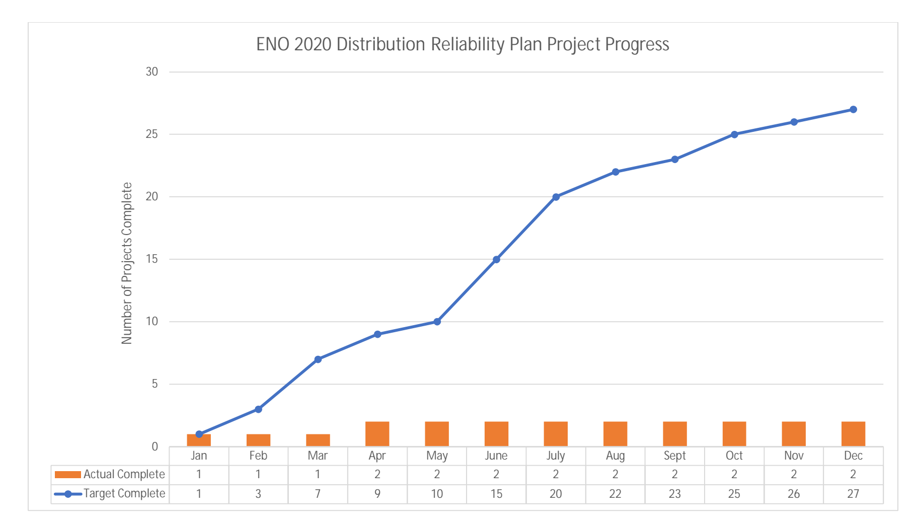
Note: This chart shows progress for 100% lateral projects, Trip Saver installations and exit cable replacements based on in-service date in Maximo.