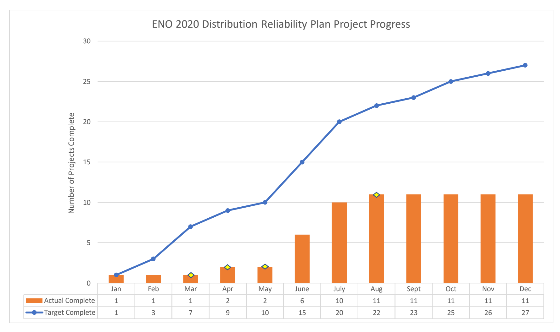
Note 1: This chart shows progress for 100% lateral projects, Trip Saver installations and exit cable replacements based on in-service date in Maximo.